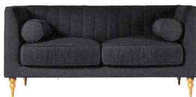
Wandsworth two-seater in Agate Blue, £899, Swoon