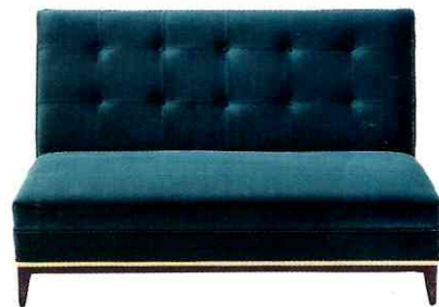
Maven two-seater, £3,996 plus 6m of fabric, Amy Somerville