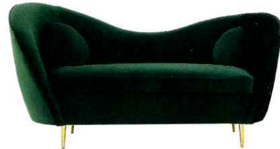
Kooper two-seater in Pine Green velvet, £499, Made.com