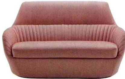
Amédée in Pink, from £2,479, Ligne Roset