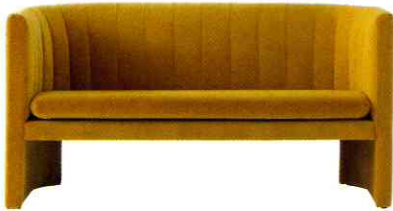
Loafer in Dandelion velvet, £3,415, Space Copenhagen for &tradition

Button detailing, fluting, sensuous curves – find the party at the back