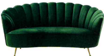
Fairmont in Green, £825, Barker and Stonehouse