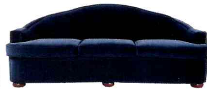
Edwin in Midnight velvet, £3,995, Soho Home