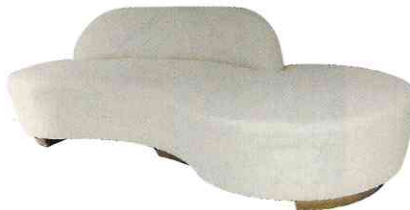
Parrot , £4,115, Julian Chichester