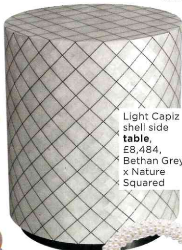
Light Capiz shell side table, £8,484, Bethan Grey x Nature Squared