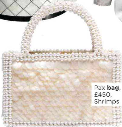
Pax bag, £450, Shrimps