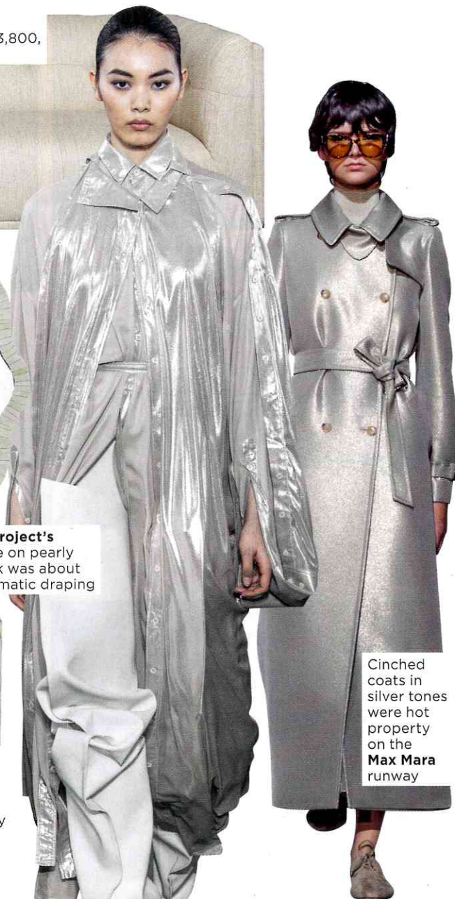
Y/Project's take on pearly pink was about dramatic draping