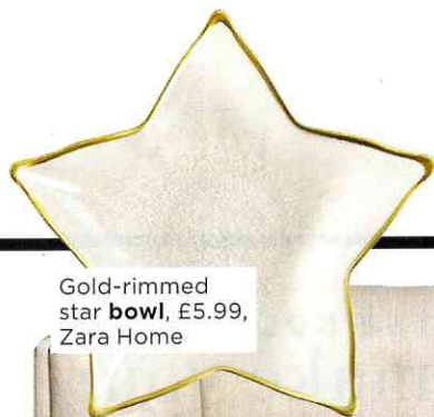
Gold-rimmed star bowl, £5.99, Zara Home