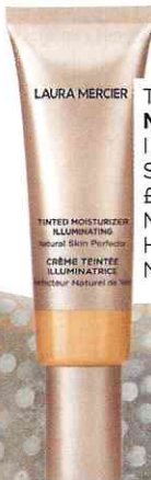
Tinted Moisturiser Illuminating SPF30, 50ml, £35, Laura Mercier at Harvey Nichols