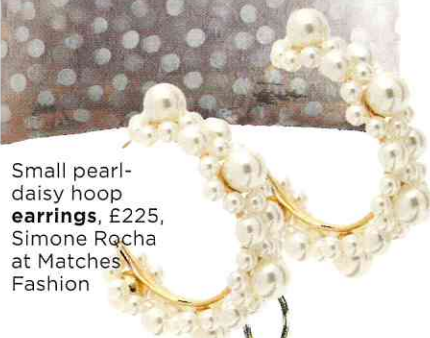
Small pearl-daisy hoop earrings, £225, Simone Rocha at Matches Fashion