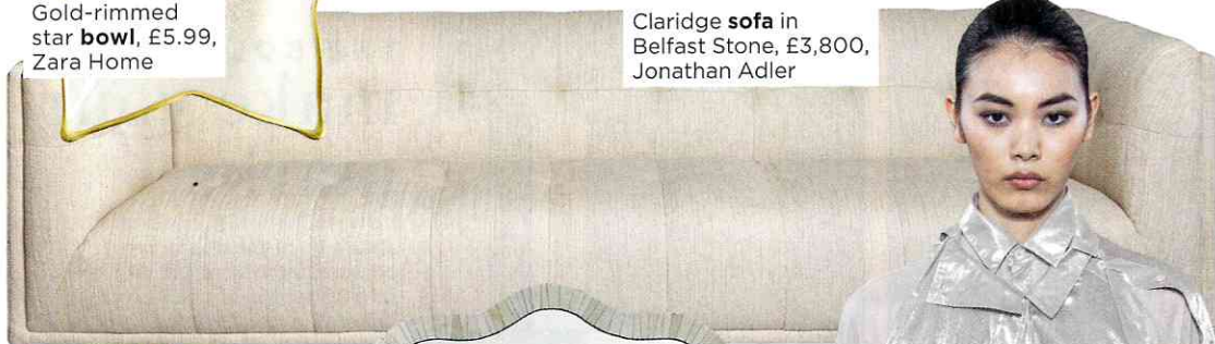
Claridge sofa in Belfast Stone, £3,800, Jonathan Adler